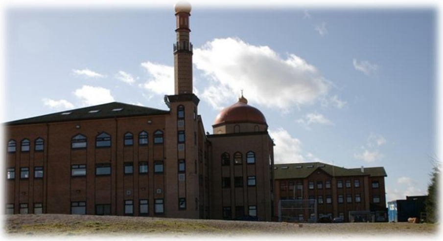
Figure 4 - Jamiatul Ilm Wal Huda, Blacburn