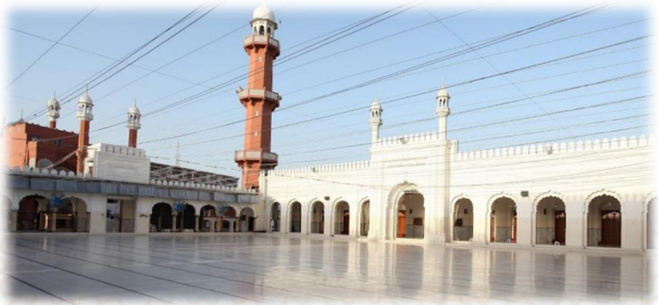
Figure 1 - Jamia Al Uloom Al Islamia Binoori Town