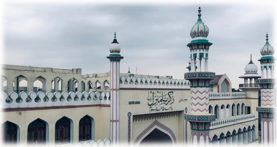
Figure 2 - Mazahir Uloom - Saharanpur