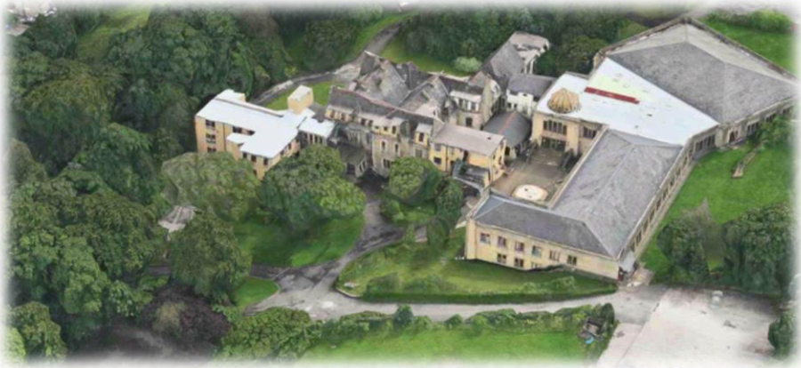
Figure 3 - Darul Uloom Bury